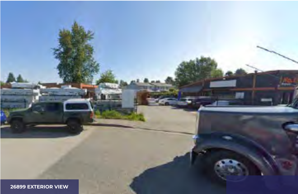
26899 EXTERIOR VIEW