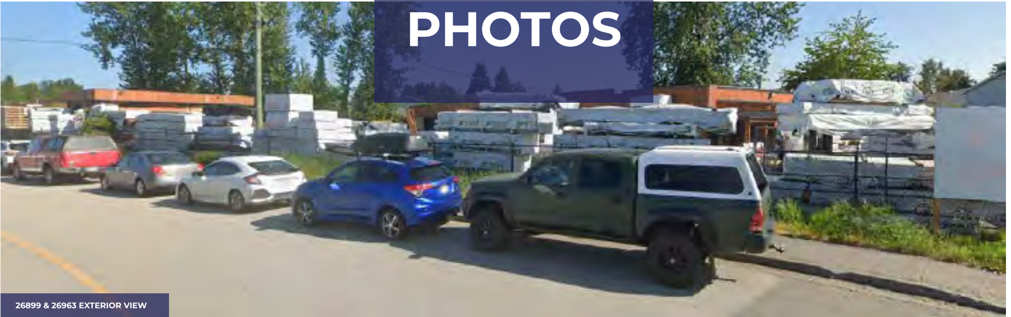
26899 & 26963 EXTERIOR VIEW